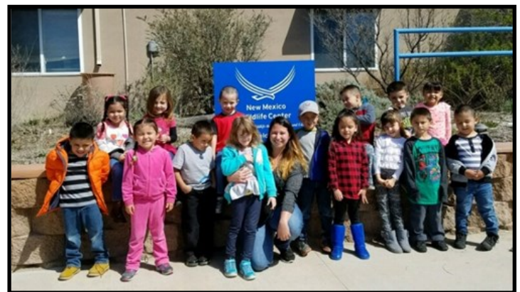
Conjunto Preschool field trip finds the students at the New Mexico Wildlife Center.

In fiscal years 16/17, 670 children and parents or caregivers received direct FIT/EI services and an estimated additional 2,318 indirectly served.