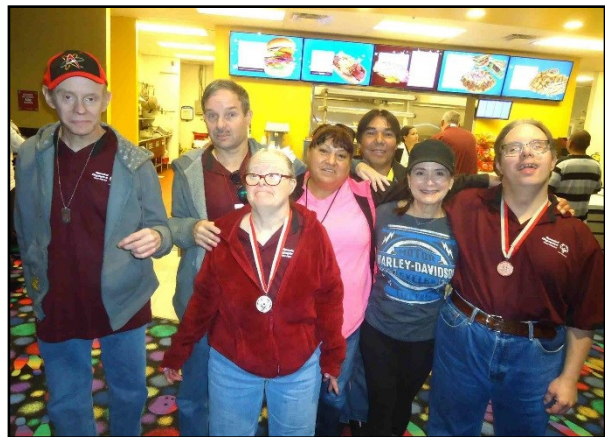
Adult clients enjoy an evening of bowling

In fiscal year 2016 and 2017, seven adults resided in the agency Supported Living home in the Los Alamos area.